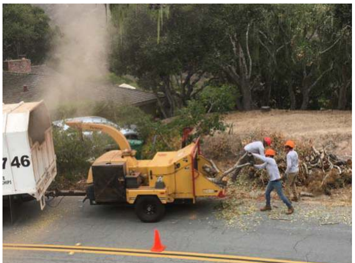
The annual RTG chipping program helps residents reduce fuel load