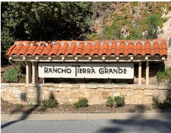
Newly Renovated Entrance Sign